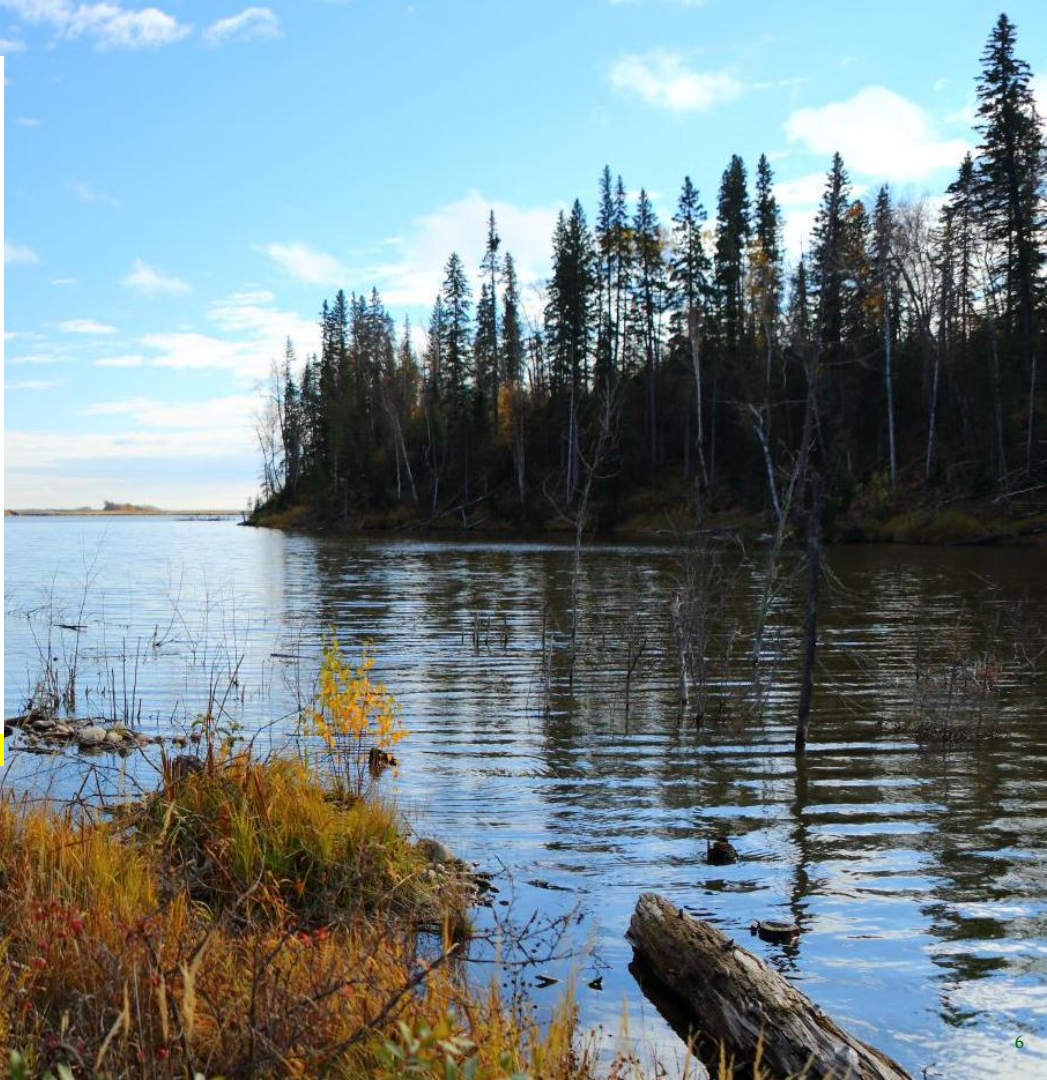
Photo: Lake near Terre de Grace